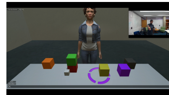
Figure 1: Diana’s world (human inset in upper right)

Diana understands up to 34 individual gestures which the human can use to both indicate specific objects as well as what to do with them. She also understands spoken language in the form of full or partial sentences, allowing these modalities to be mixed and matched in real time in the manner of