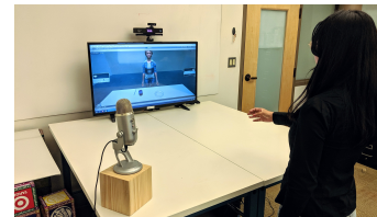
Figure 2: Diana’s world within the real world

two humans interacting. For instance, a human may 1) ask Diana to “put the red block on the green block”; or 2) point to the red block, and say “(put it) on the green block”; or 3) say “the red block,” make a “claw” gesture representing “grab it,” and then point to the green block. All of these and other mixes of modality and order prompt the same action.