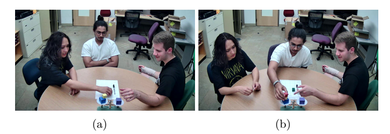
Fig. 2: Example of The Weights Task

The Weights Task is designed for in-person data collection and uses physical objects — this ensures the data is rich in both verbal and nonverbal communication, making both natural language processing and computer vision crucial elements of the pipeline. The annotation scheme encourages initial feature extraction, such as object detection and automatic speech recognition, and the combination of these multimodal elements to provide complete interpretations of the scene as action unfolds. Then, this scene can be analyzed for indicators of collaborative problem solving defined by existing frameworks.